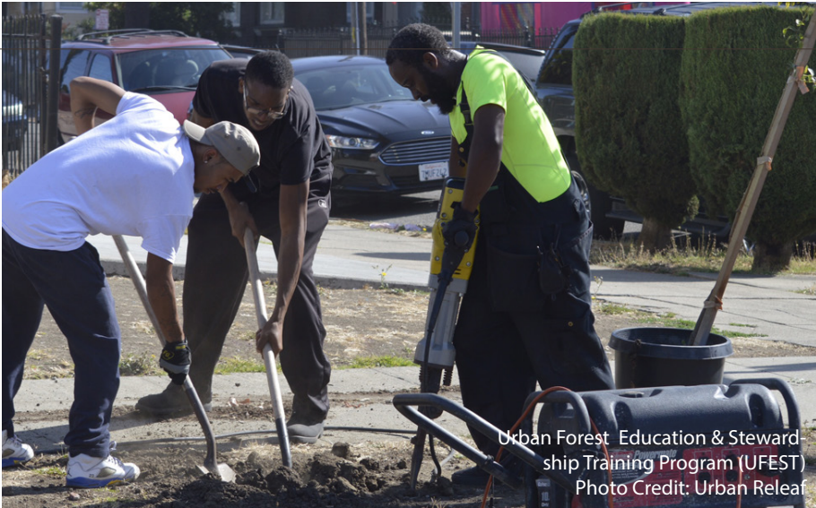
Urban Forest Education & Stewardship Training Program (UFEST)