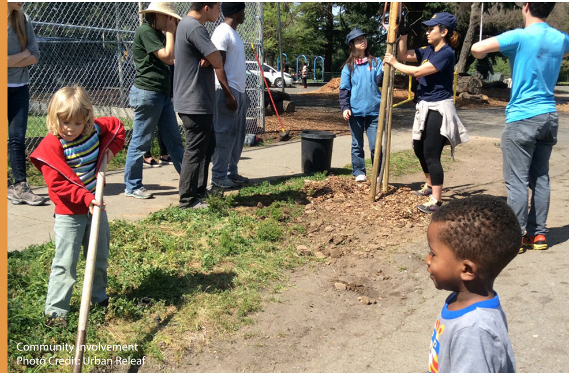
Community Involvement

Urban Releaf (2016, Oct 29). Tribute to Muhammad Ali Planting Oct - 2016 [Video File]. Retrieved from https://www.youtube.com/watch?v=8qnAP9SOA9I .