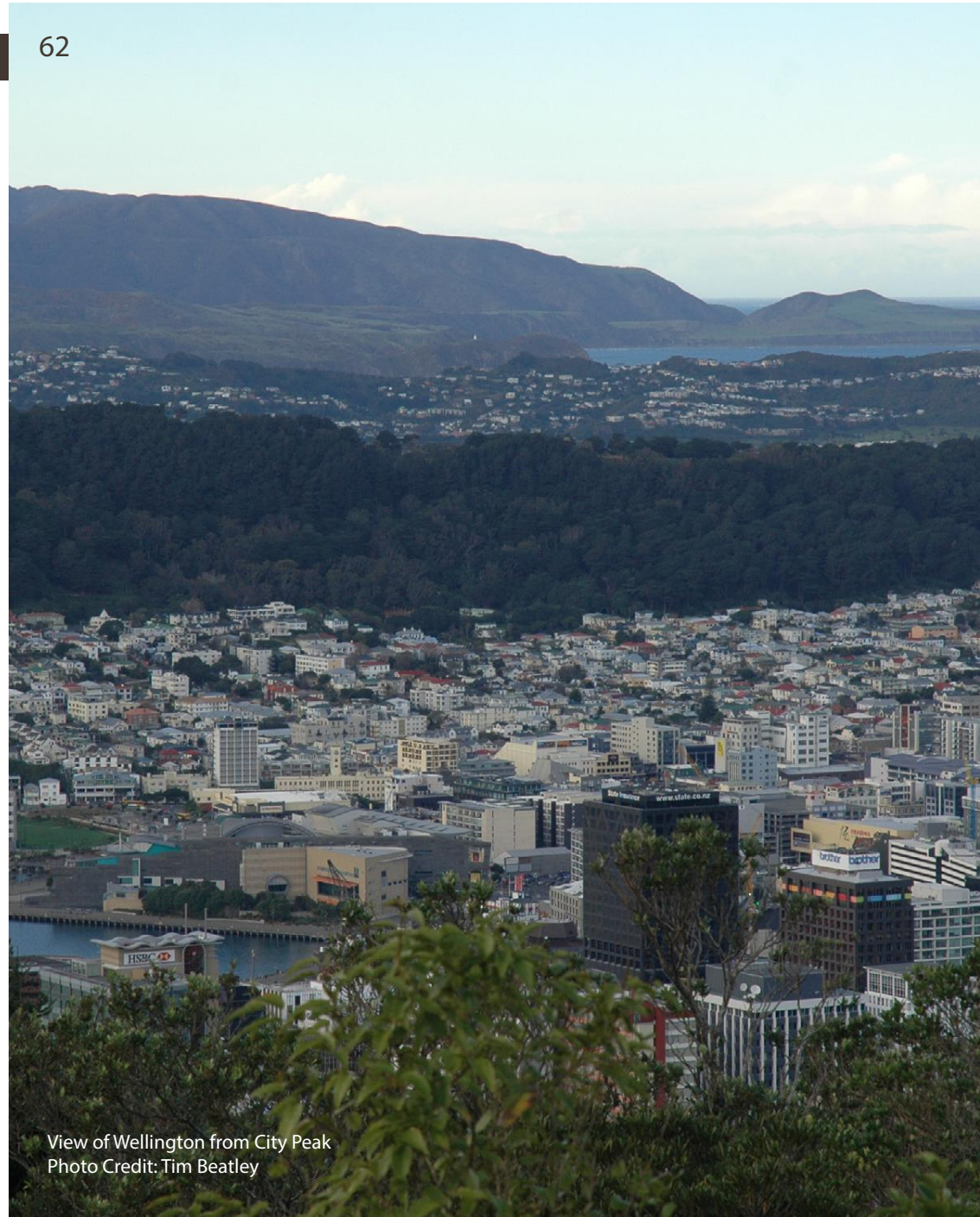
View of Wellington from City Peak

Planning Department. Market Octavia Living Alleys Program. City and County of San Francisco, CA. Retrieved from http://sf-planning.org/market-octavia-living-alleys-program.ion