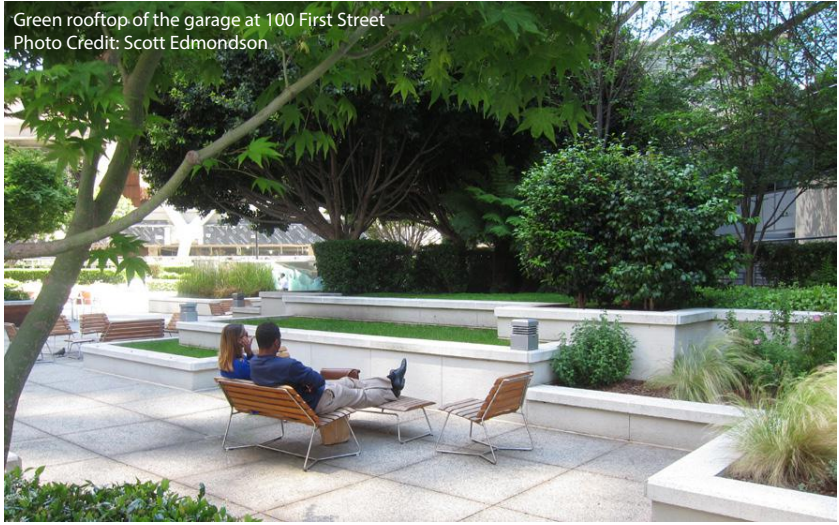
Green rooftop of the garage at 100 First Street