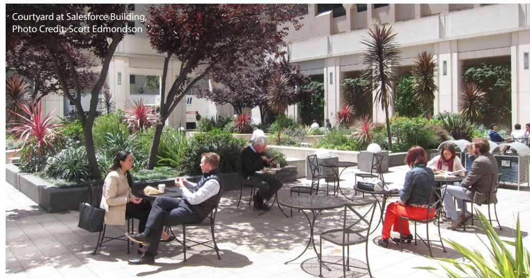
Courtyard at Salesforce Building.

All in all, this one-day visit was just a snapshot of the rich array of strategies and new ideas that Singapore and San Francisco, both members of the Biophilic Cities Network, have to share with each other and cities around the world on integrating nature and cities.