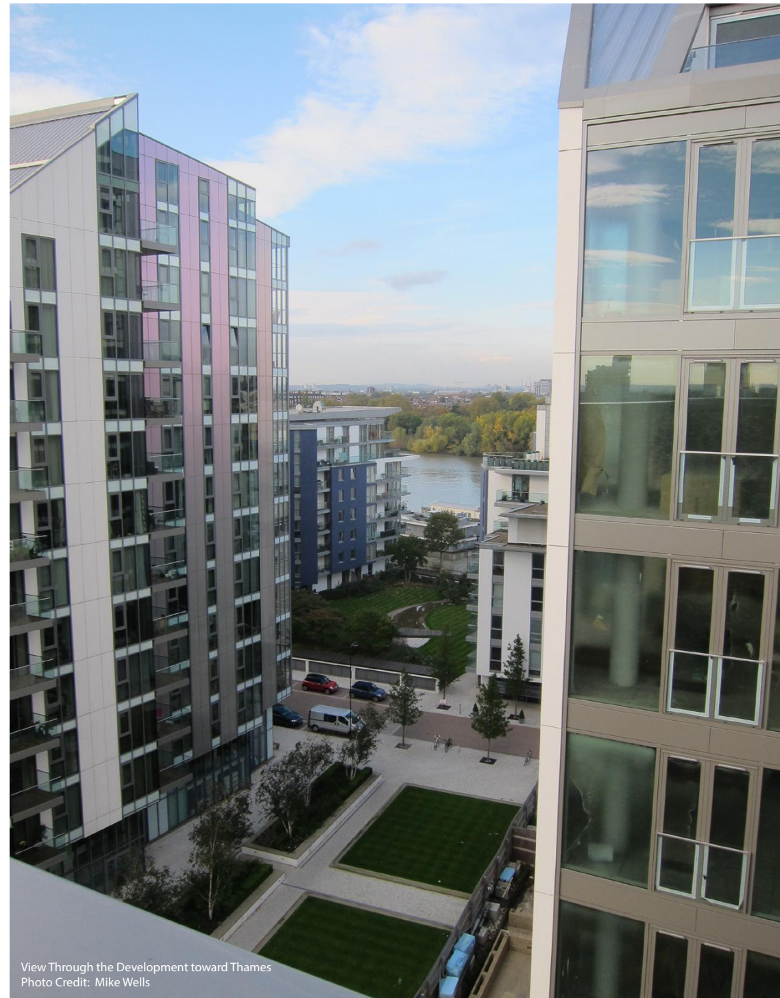
View Through the Development toward Thames

Waterhouse, Waterhouse Lane, Monkton Combe, Bath, BA2 7JB, UK t: +44 (0)1225 723 199 | www.biodiversitybydesign.co.uk