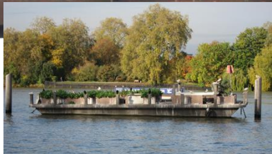
ABOVE AND LEFT: Bird Barge with roosting cormorant and gulls