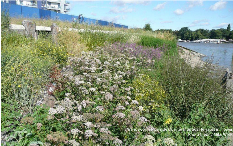
Wandsworth Riverside Quarter Intertidal Terraces in Flower

roof level were designed with careful consideration of the autecology of displaced and other target species. For example, the biodiverse roofs incorporate areas designed for shallow floods in winter and summer rainstorms, to mimic the conditions of river-edge gravel habitats frequented by uncommon terrestrial invertebrates. Particular plant species required as food plants by certain species were favored in the design. The proposals included the installation of a wooded, semi-natural play area by the River Wandle with a very rich native groundflora and a wide variety of specific habitat installations for target species.