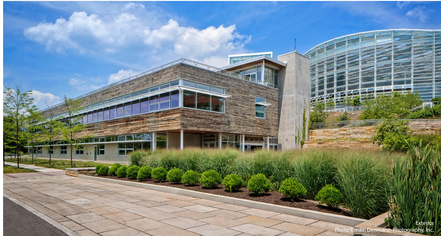
Exterior Photo Credit: Denmarsh Photography, Inc.

One of the world's greenest buildings, the Center for Sustainable Landscapes (CSL) at Phipps Conservatory and Botanical Gardens generates its own energy and treats all water captured on-site. It is the only building to meet the Living Building Challenge, LEED Platinum, Four Stars SITES and WELL Building Platinum certifications. The project's traditional biophilic design elements — including views and connections to nature — are enhanced by a biophilic art program that includes a site-specific sound installation of local nature recordings that permeate the building's atrium based on the time of day, season and weather, and reinforce the connection between human and environmental health.