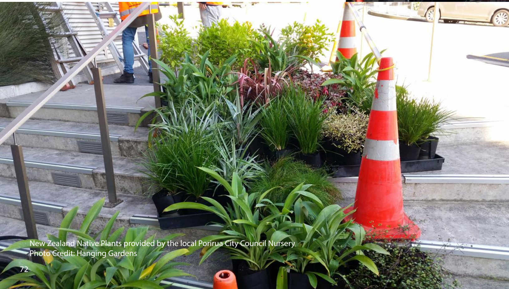
New Zealand Native Plants provided by the local Porirua City Council Nursery