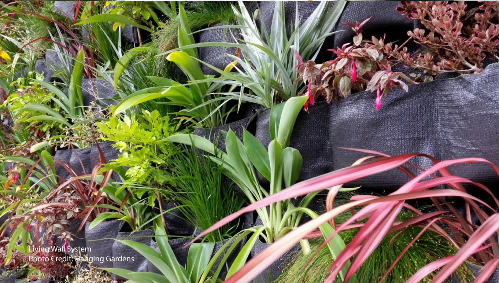
Living Wall System