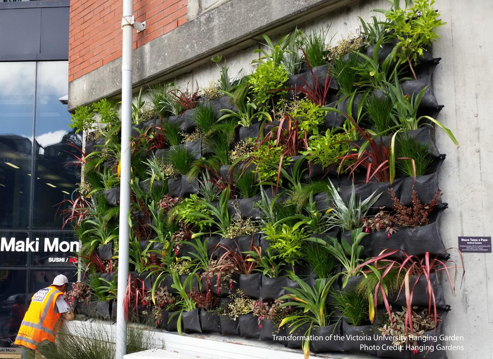
Transformation of the Victoria University Hanging Garden