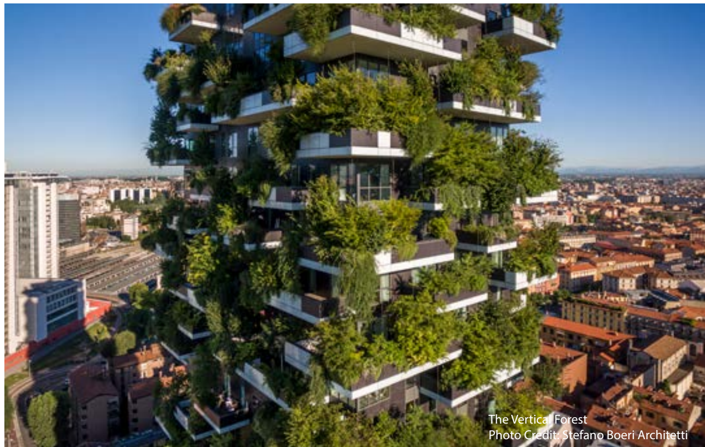
The Vertical Forest Photo Credit: Stefano Boeri Architetti