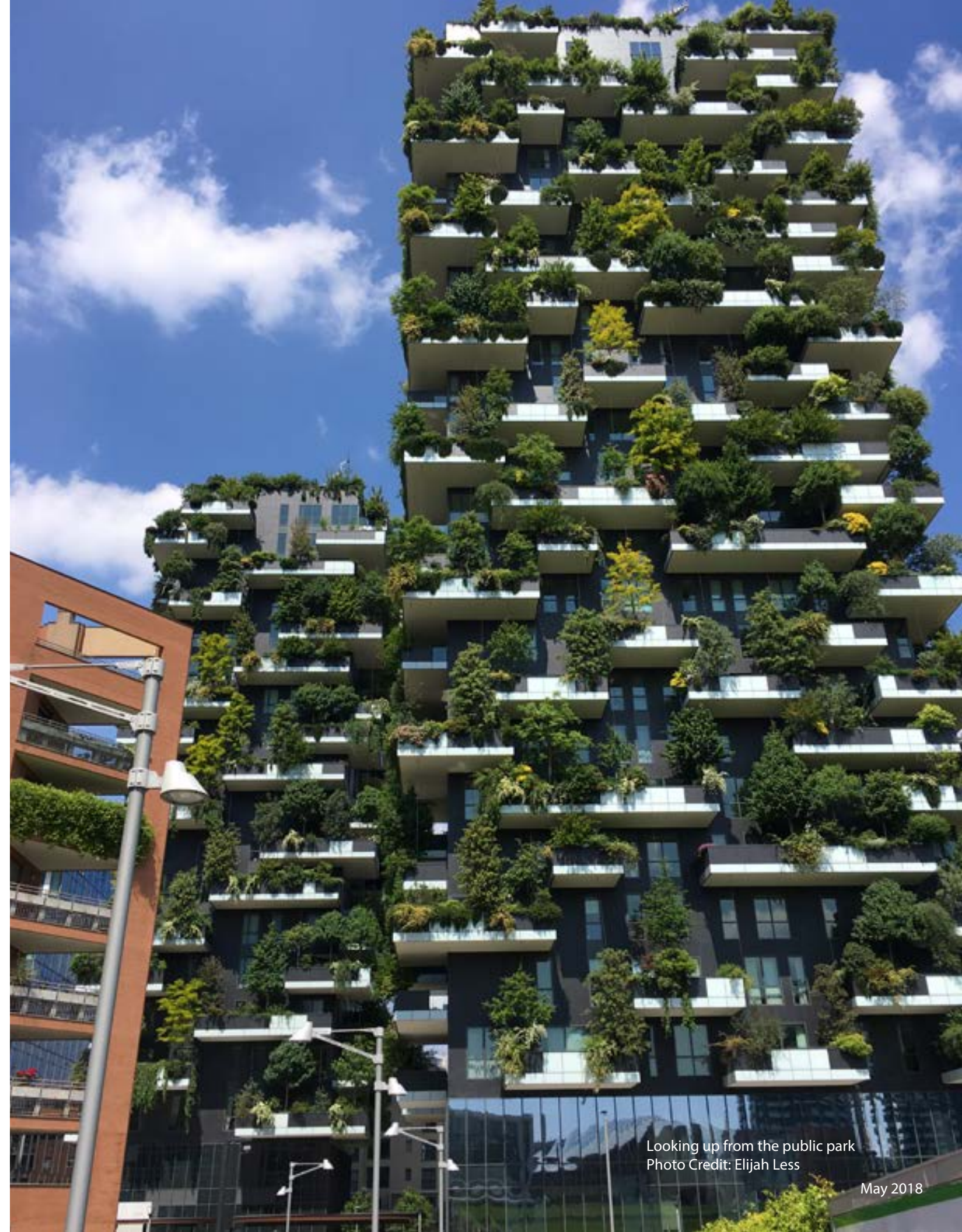
Looking up from the public park

T. R. Hamzah & Ken Yeang (April 2014). Solaris at Fusionopolis. Greenroofs.com. http://www.greenroofs.com/content/articles/126-SOLARIS-at-Fusionopolis-2B-From-Military-Base-to-Bioclimate-Eco-Architecture.htm#.WplVaejwaUk .