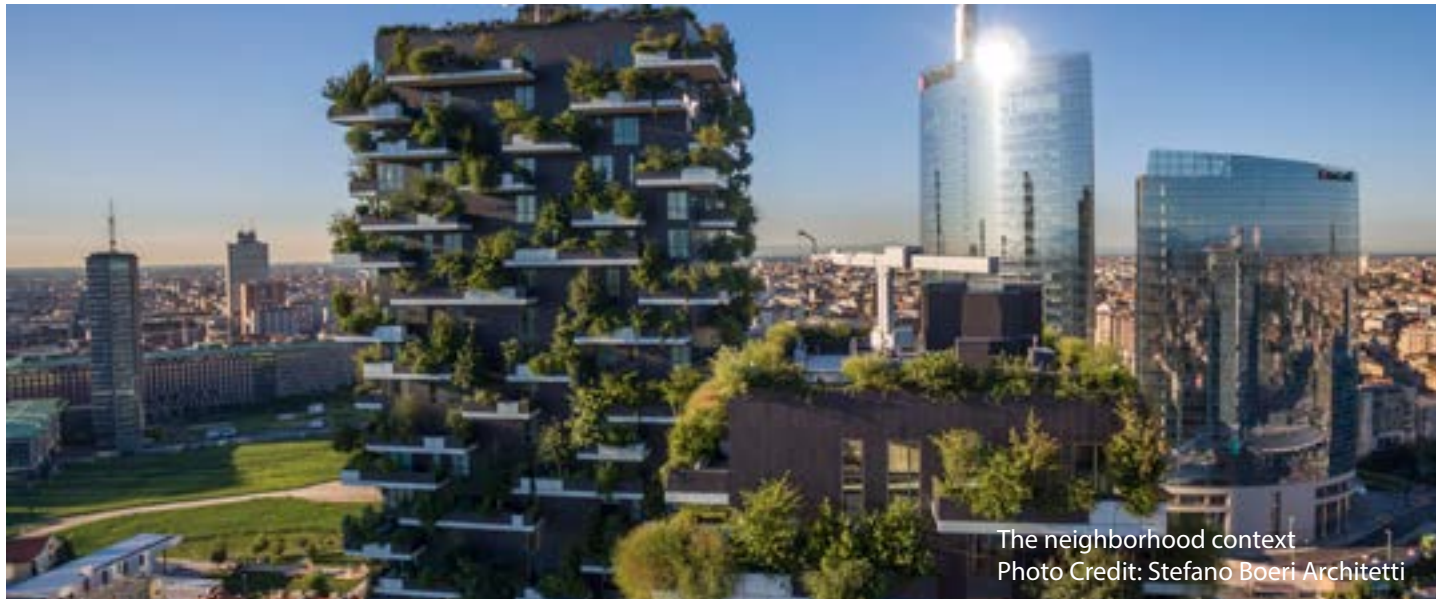
The neighborhood context Photo Credit: Stefano Boeri Architetti

The settings at Bosco Verticale begin to defy current categorization. Using the term “garden” to describe these places is inaccurate, because gardens have traditional practices, orders, and narratives that fail to properly translate in these new settings. Bosco Verticale places humans in contact with nature, and subsequently other people, in a novel way to reveal the innovative potential of biophilic architecture.