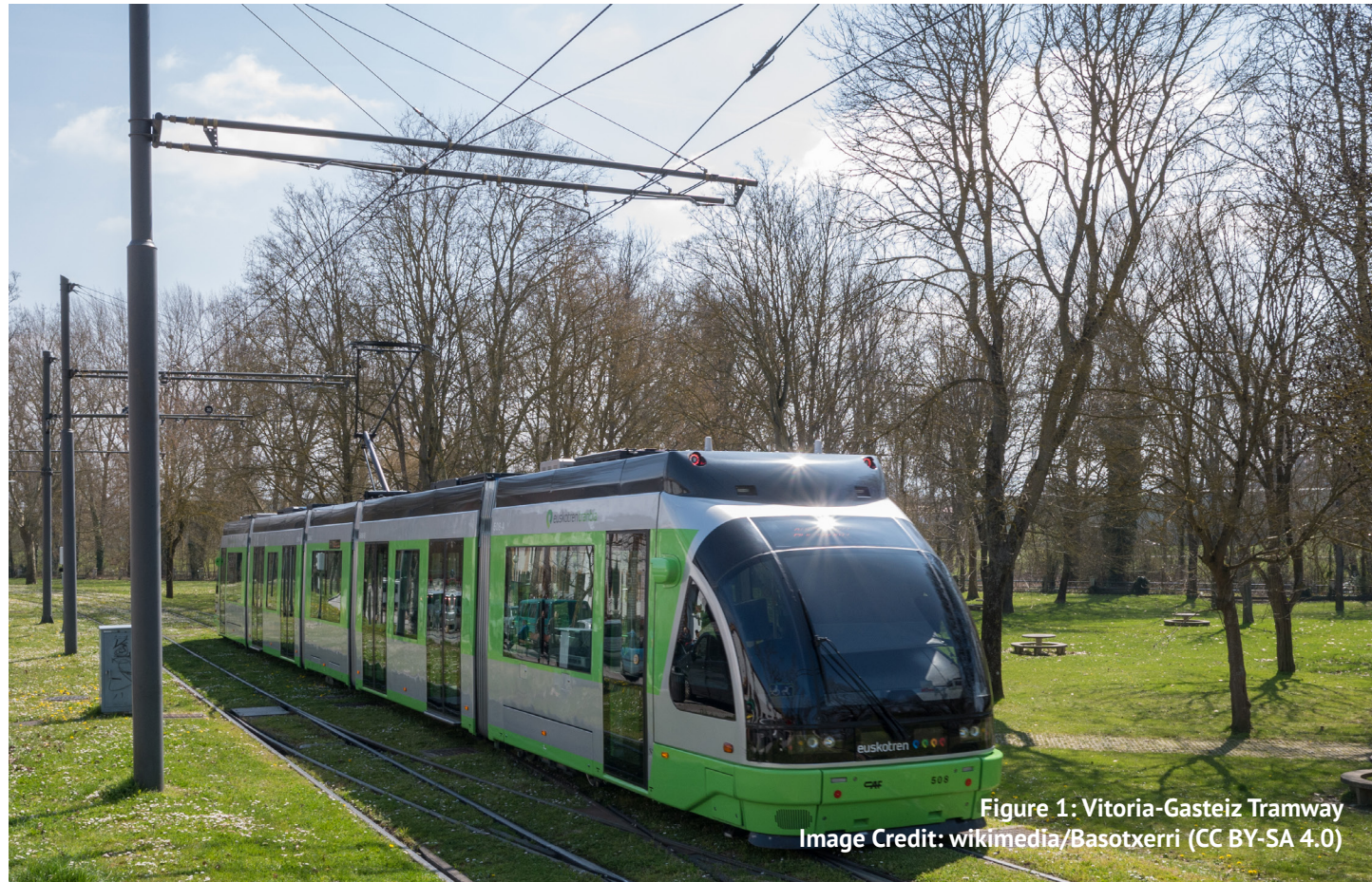
Figure 1: Vitoria-Gasteiz Tramway