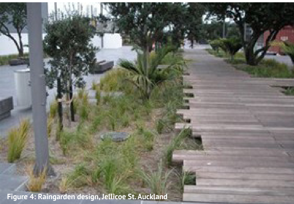
Figure 4: Raingarden design, Jellicoe St. Auckland