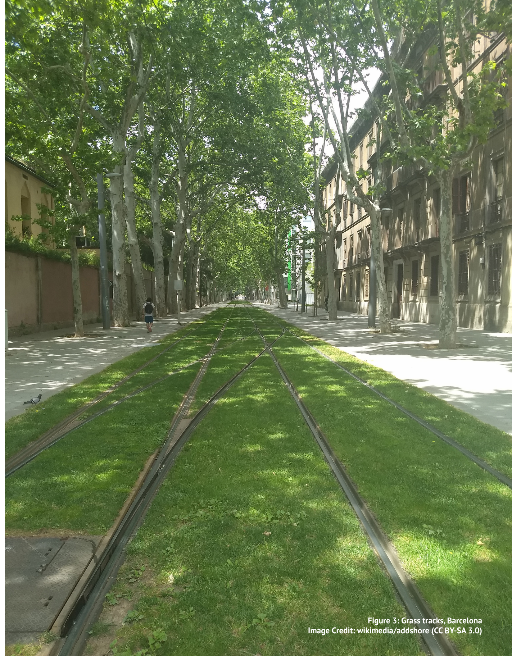
Figure 3: Grass tracks, Barcelona

While the final alignment of Auckland light rail is yet to be decided, the alignment will likely be adjacent to roads carrying between 15,000 and 25,000 vpd, all classified as high contaminant generating activities. Some of this overlies fractured basalt zones where stormwater is directed to soakage (and then to aquifers) or combined stormwater/sewer networks. The aquifers feed urban catchments that in turn discharge to coastal areas under permanent swimming bans. Other areas have more standard stormwater systems that discharge directly