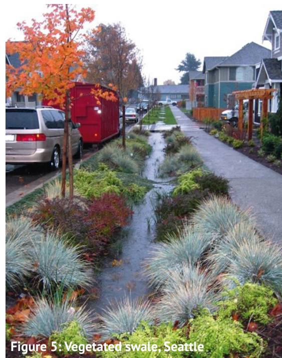
Figure 5: Vegetated swale, Seattle