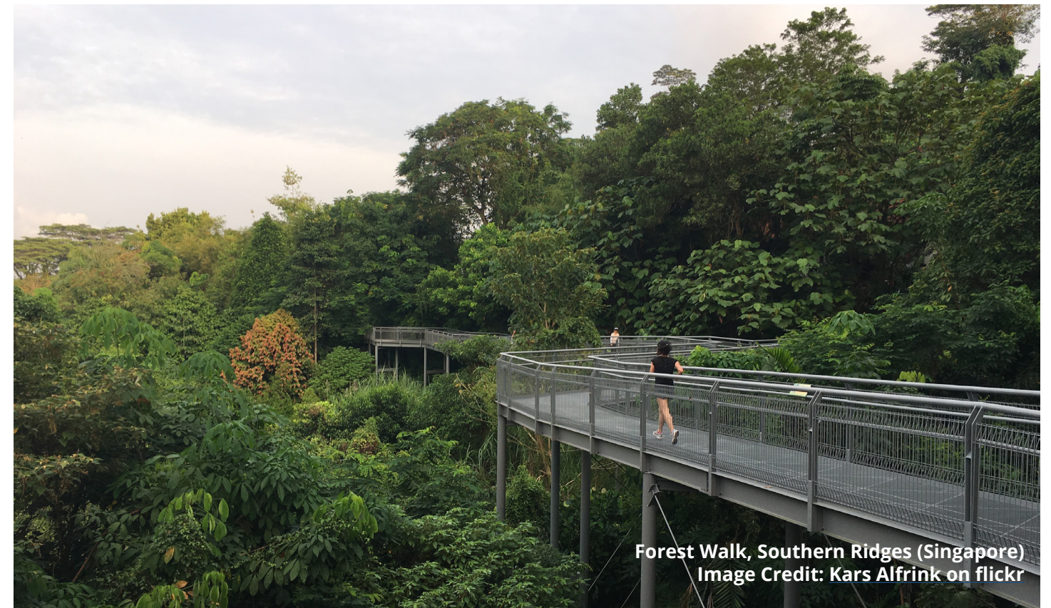
Forest Walk, Southern Ridges (Singapore)

Urban areas characterized by high vegetation report fewer property and violent crimes than areas that lack vegetation.