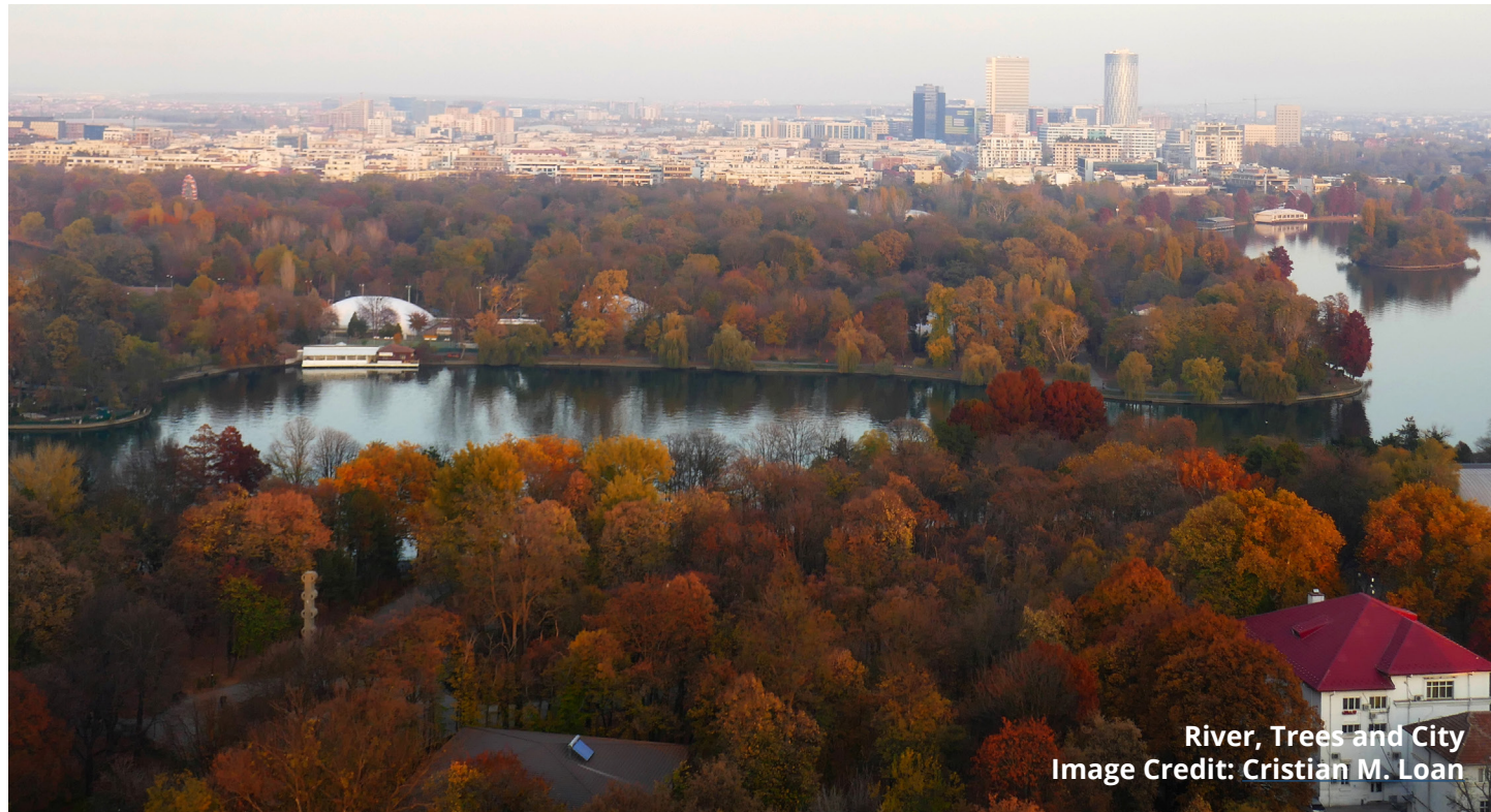
River, Trees and City